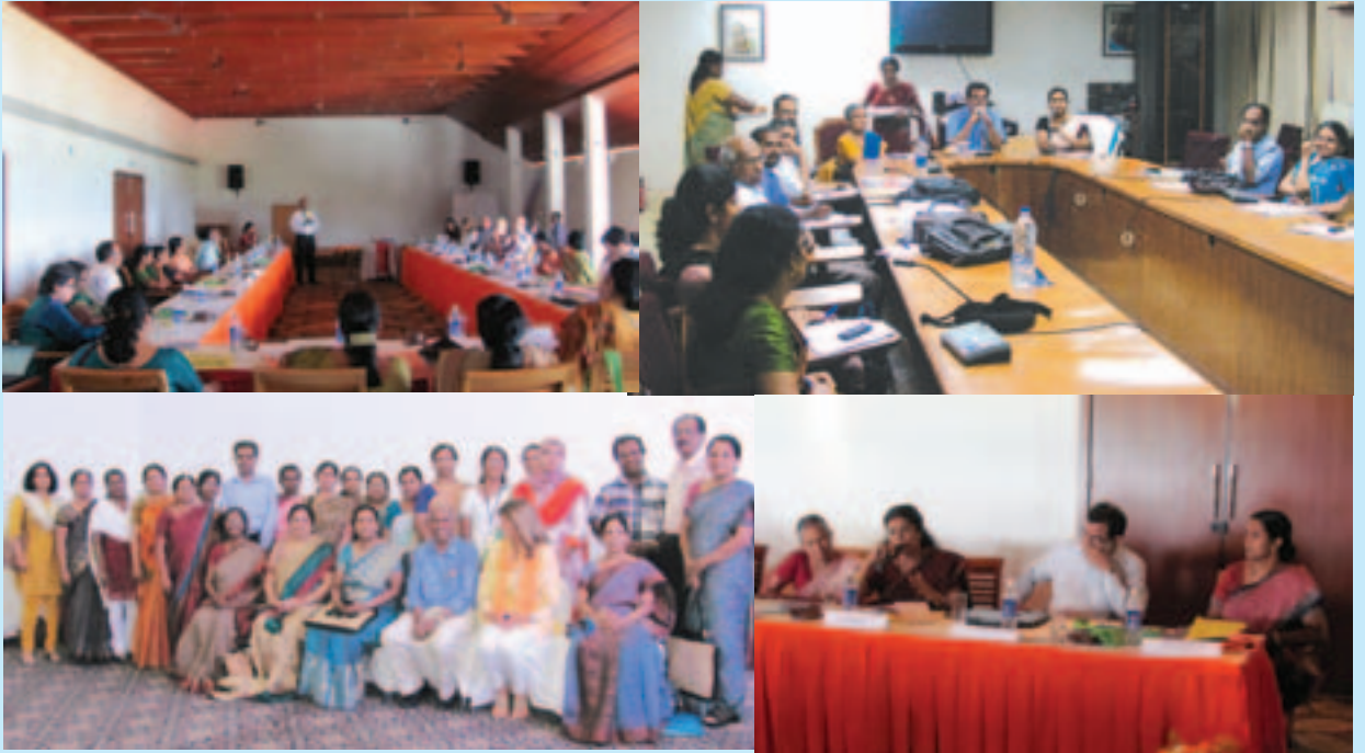
Planning & Review meetings on different occasions