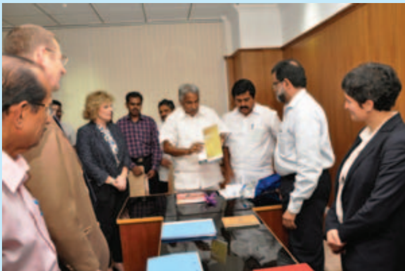
C M releasing QS with British Health Minister